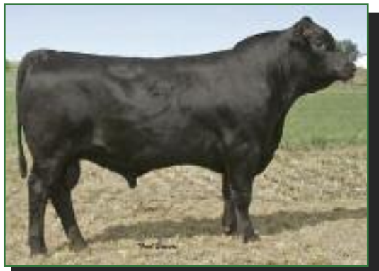
BASIN NEW TREND 4554 SIRE OF LOT 71 HEIFER CALF

The Gravity calves are in great demand. They have been some of our most popular. Their show stoppers. Sells with a heifer calf at side 8144 (#1228534) born 5/25/08, sired by Basin New Trend 4554. 80 lbs.