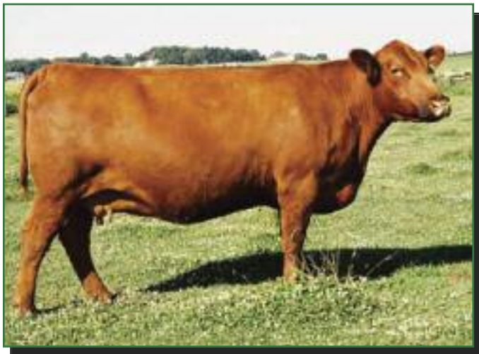
NER COPPER QUEEN 1853 • LOT 35