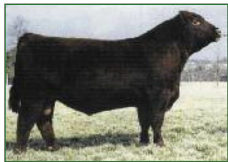
BADLANDS MR BEEF 805 BW -0.7; WW 42; YW 88; MILK 15; TM 36; STAY 11; MARB 0.03; REA -0.36