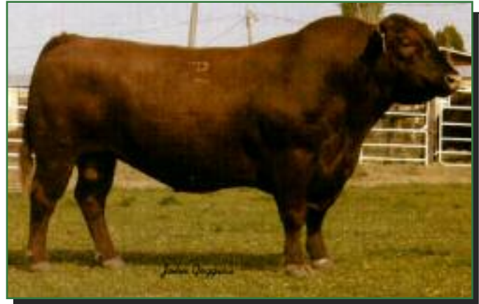
GLACIER CHATEAU 744 • SERVICE SIRE OF LOT 99