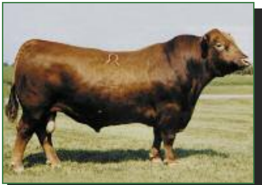
LCHMN GRAND CANYON 1244G SIRE OF LOT 34