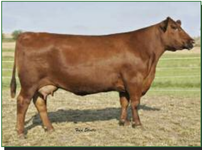
SRN MAGGIE 2071 • LOT 51