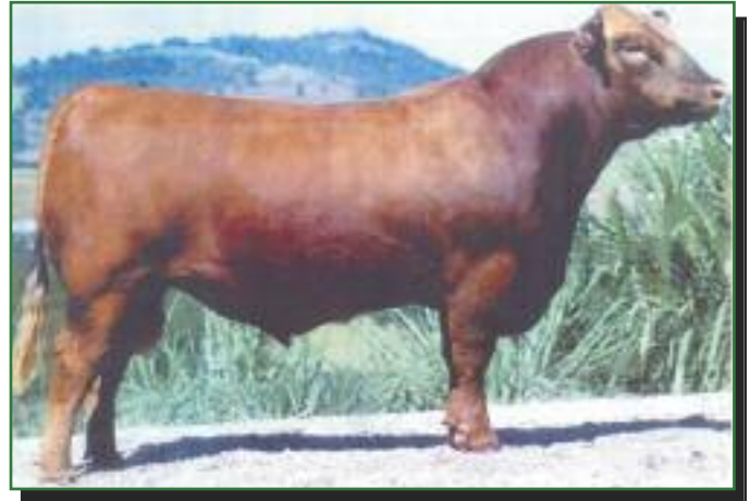
UBAR GRAND PRIX 102 • SIRE OF LOT 42

Here is a chance to put the power back into your herd. Penny 4079 is sired by Grand prix 102. He was a bull the made a name for himself on the tan bark, before venturing out into the pasture. He has since been exported to South America, so semen supply is limited. There really was never a question about this bull potential with us, as he hails from the same cow family that produced the 7166 cow that did great things for the Shamrock Nook farm.