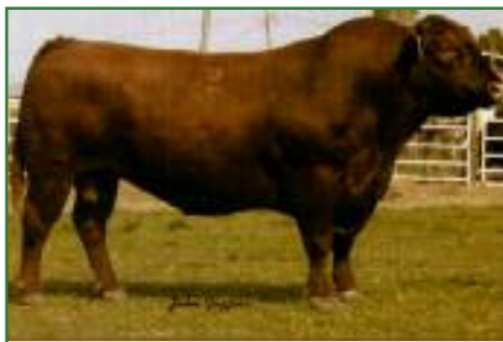
GLACIER CHATEAU 744 BW -1.6; WW 33; YW 68; MILK 25; TM 41; STAY 16; MARB 0.01; REA 0.26