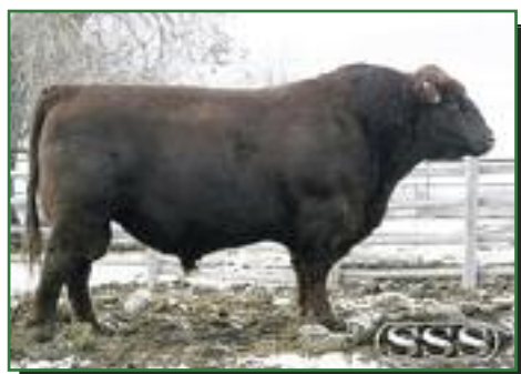
5L NORSEMAN KING 2291 BW 1.7; WW 32; YW 62; MILK 22; TM 38; STAY 8; MARB 0.11; REA 0.52