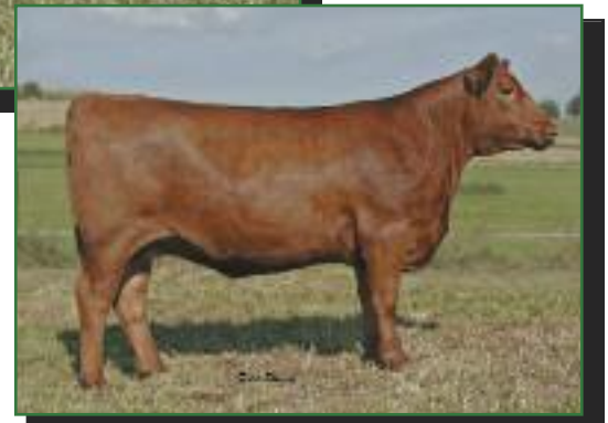
SRN BLOXY 5059 FULL SISTER TO LOT 29A