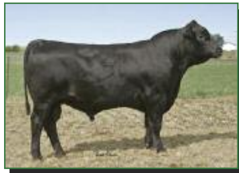
BASIN TREND SETTER 45S4 BW -1.5; WW 25; YW 48; MILK 23; TM 35; STAY 13; MARB 0.38; REA 0.17