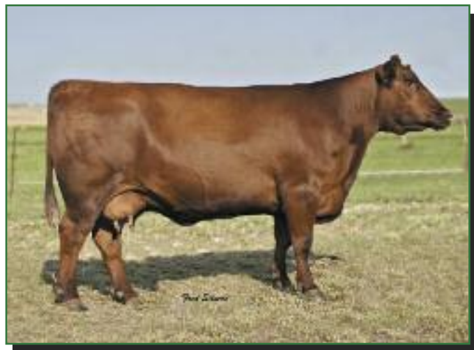
PERKS MISS ADVANCE 109R • Lot 58