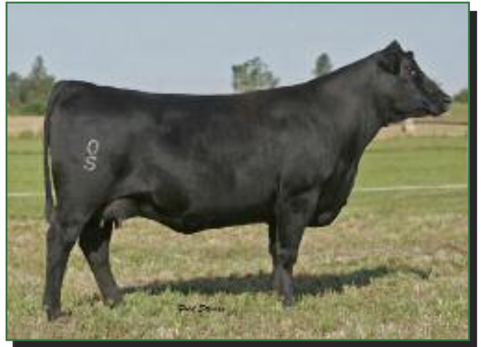
EAGLE 1407 BLACKCAP 274M

Miss Wix 8058 is a Hemi calf with a world of cow power behind her.