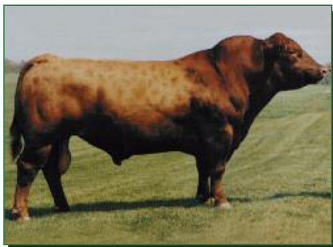
BFCK CHEROKEE CNYN 4912 • SIRE OF LOTS 105 AND 107

4071 is a nice young Cherokee Canyon daughter with balanced EPDs and 101.1 MPPA.