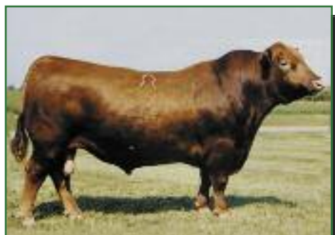
LCHMN GRAND CANYON 1244G BW 1.1; WW 36; YW 77; MILK 29; TM 47; STAY 17; MARB 0.04; REA 0.12