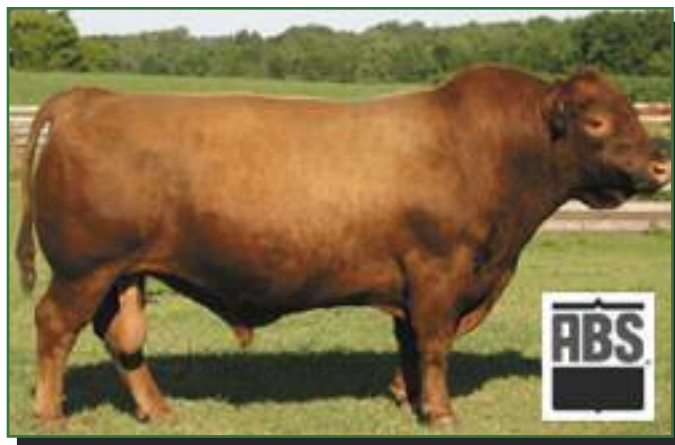
LCC GRAVITY B252L • SIRE OF LOT 65