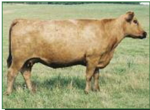
SRN ROBIN 0008 ET LOT 44

The 94K cow needs little introduction if you have been following the breed for the past 10 years. Her dam is none other than Hanson 26B cow, a Sam's Prospector daughter with really unparallel production for growth. Over a 4 year period in the mid 90's, she produced a calf that went through the Nile Sale at or above the $10,000 mark.