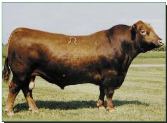
LCHMN GRAND CANYON 1244G • SIRE OF LOT 69