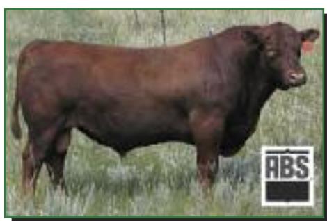
MESSMER JUDGE 36N BW 0.8; WW 38; YW 63; MILK 14; TM 33; STAY 18; MARB 0.16; REA 0.18