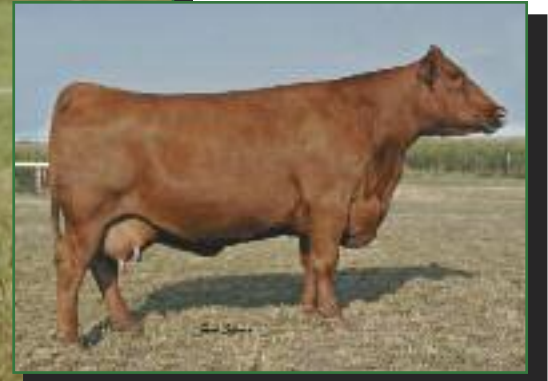
SRN HI DEE Ho 8026 GRAND DAM OF 30