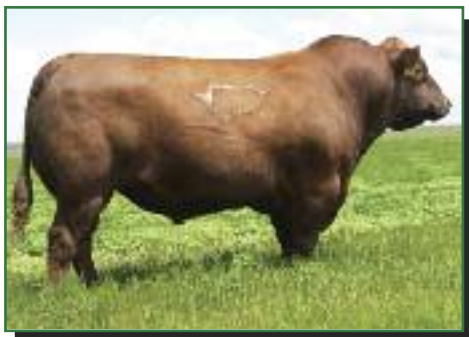
SCHULER SILVER BULLET 4604P SIRE OF LOT 28

3505 is impressive, and all you can hope for from a Tidy Bee. If you looking for a low birth weight donor to mate with please have this girl marked with a big red X. Another highlight is the Chateau 744 that she will calve next spring.