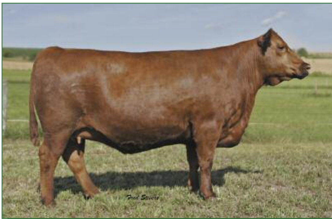
BJR SRN TIDY BEE 1019 • LOT 26