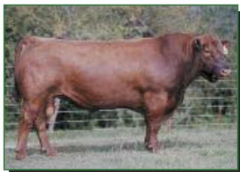
BIEBER MAKE MIMI 7249 BW -2.1; WW 33; YW 61; MILK 23; TM 39; STAY 17; MARB 0.26; REA 0.00