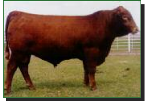
BUF CRK ROMEO L081 • SIRE OF LOT 77