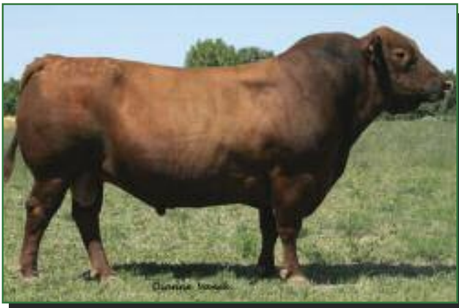
BECTON NEBULA N045 • SERVICE SIRE TO LOT 13

Bred 4/17 to BECTON NEBULA P093 (#978419). Pasture exposed from 5/1-5/17 to LCOC ROMERO A007T (#1179471), then from 5/18-8/1 to SRN SCRIPT.