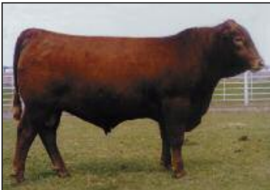
BUF CRK ROMEO L081 • SIRE OF LOT 9

Will calve by sale date. Service to BASIN NEW TREND 4554 (#1121766).