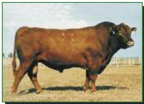
BJR MAKE MY DAY 981 BW -2.5; WW 30; YW 63; MILK 23; TM 38; STAY 20; MARB 0.67; REA -0.21