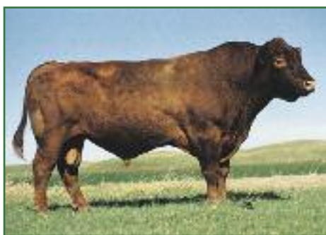
FCC RAMBO 502 BW 2.3; WW 33; YW 59; MILK 13; TM 30; STAY 15; MARB -0.23; REA -0.13