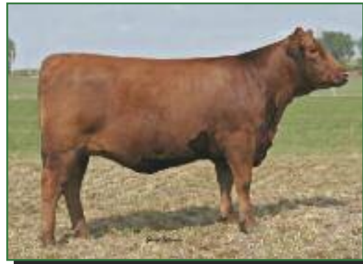
SRN HI DEE 6114 DAUGHTER OF LOT 30

She comes from the high performance cow family as well. It all starts will our 8026 cow and carries through to 1005, but I don't think it will end with 3021. The future is big and bright for this donor and her progeny. If you're searching for the cow to build a program around, you have to find Hi Dee 3021. I know of no cow better!! 108.0 MPPA