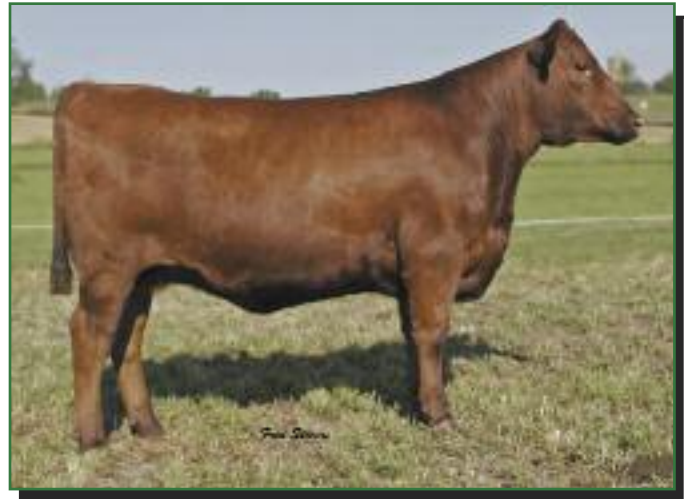
SRN LASS 5045 • DAUGHTER OF LOT 38

Bred 5/8/08 to BECTON NEBULA N045 (#854775). Pasture exposed from 5/15-8/1 to HXC HEMI 4400P (#993332). Here is the best Blaze 6129 cow on the farm. She is major league thick, and full of red meat. When you combine that with a pedigree from a prove cow family, you have a prospective donor cow.