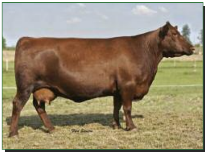
SRN PENNY 1078 • LOT 91