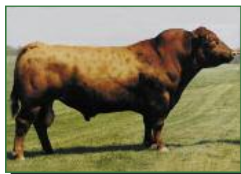
BFCK CHEROKEE CNYN 4912 BW -0.6; WW 40; YW 64; MILK 20; TM 40; STAY 13; MARB 0.14; REA 0.58