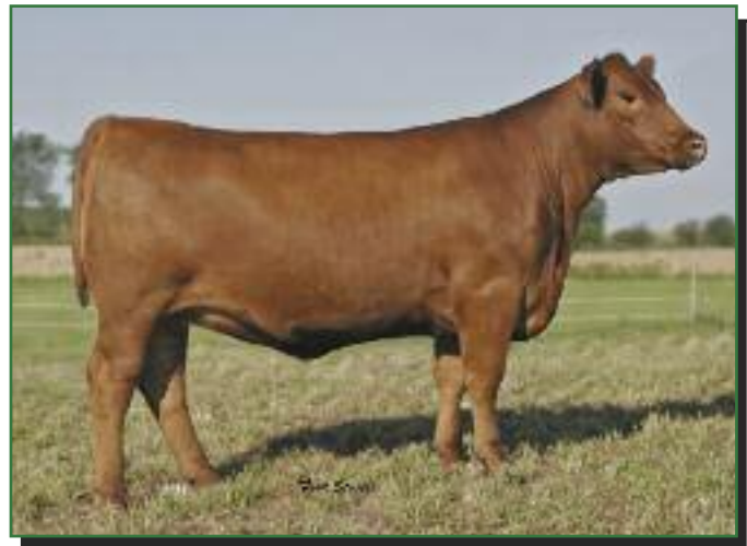
SRN LASS 5023 • DAUGHTER OF LOT 39

Bred 4/16/08 to BIEBER ROMERO 9136 (#899669). Pasture exposed from 5/18-8/1 to BASIN NEW TREND 6346 (#1121899). This rare daughter of carcass sire, Glacier Marias 548-will be a real find for who ever takes her home. EPD ranks her in the top 5% of the breed for weaning and yearling weight.