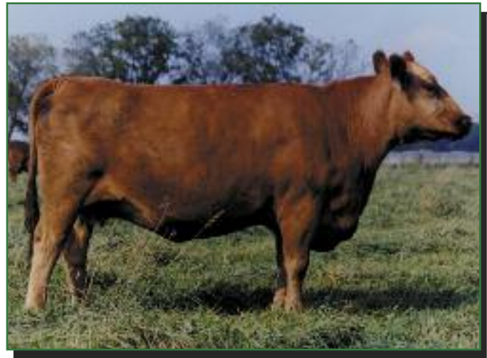
FARN RED DESTINY 712 • LOT 70

We have quite a story to tell you about the destiny 712 cow. It is much to long to tell you here, but to bring you up to speed quick here goes. We purchased Mike Farnsworth's whole herd just to get the 712 cow. She became a lead donor here, and we marketed a large group of her eggs to Mexico, Brazil, and China. Her average flush was 18+. We later sold her to Ner Farms (Black Angus outfit) to become their lead donor because of her unbelievable fertility. They flushed her with great results, and then we purchased her back for more export. 712's sire is the North of the border sensation Brylor New Trend 22D.