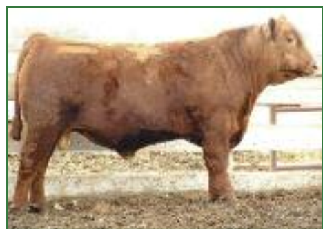
BASIN HOB0 3003 BW -1.9; WW 25; YW 51; MILK 24; TM 37; STAY 15; MARB 0.27; REA -0.03