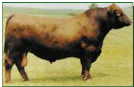
GLACIER MARIAS 548 BW 2.9; WW 42; YW 69; MILK 25; TM 46; STAY 15; MARB 0.35; REA 0.22