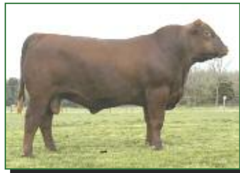
LSF COMBINATION A301M BW 2.1; WW 42; YW 77; MILK 2; TM 23; STAY 13; MARB 0.20; REA 0.09