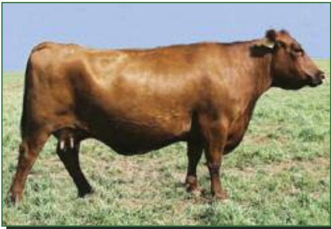
SRN ELEANOR 3530 • LOT 18