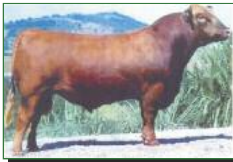
UBAR GRAND PRIX 102 BW 0.7; WW 34; YW 68; MILK 25; TM 42; STAY 16; MARB -0.18; REA 0.29