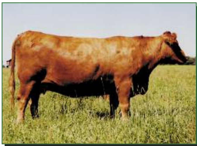
DOUBLE FORK 061C • DAM OF LOT 68

Fall bred cow – due date pending. Pasture exposed to BASIN NEW TREND 4554 (#1121766). 271 is a Grand Canyon daughter that stems from the same family that produced Hi Ho 574.