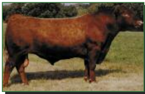
LCC CHEYENNE B221L BW 0.3; WW 43; YW 84; MILK 25; TM 47; STAY 11; MARB 0.40; REA 0.16