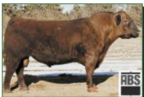
BECKTON LANCER F442 T BW -0.3; WW 31; YW 51; MILK 10; TM 26; STAY 9; MARB 0.22; REA 0.59