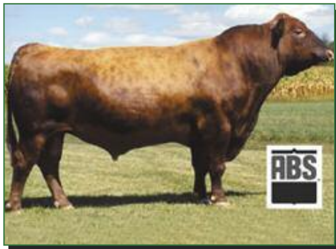
LCC ABOVE & BEYOND 1300J • SIRE OF LOT 104

Dutchess 6150 is AI to the fast rising Nebula P093 bull. Be the first to have a calf by this sure fire superstar