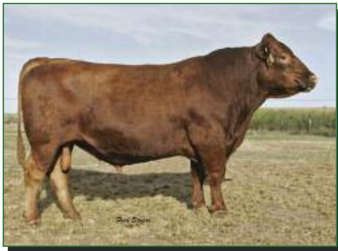
HXC HEMI 4400P • SERVICE SIRE TO LOT 22