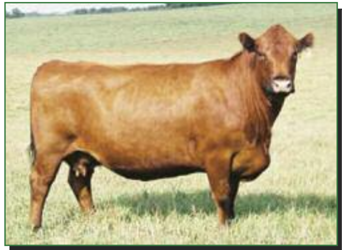
SRN ELEANOR 3524 • LOT 19

Pasture exposed from 4/15-8/1 to HXC HEMI 4400P (#993332). If you want to talk production, Eleanor 3524 is a big time performer. Her first heifer was the high seller heifer calf from our 2006 production sale to Steve Meier. Steve has always had an eye for the good ones whether it was Black or Red Angus. 3524's progeny data is very strong with a 102.6 MPPA.