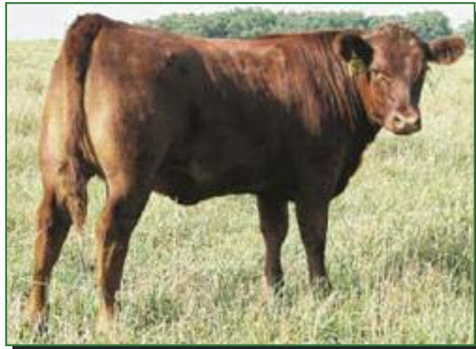
SRN Mimi 8013 • Lot 49A