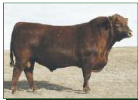
BIEBER ROMERO 9136 BW -3.9; WW 31; YW 56; MILK 26; TM 42; STAY 15; MARB 0.24; REA 0.13