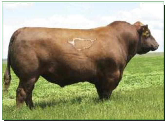
SCHULER SILVER BULLET 4604P • SIRE OF LOT 89

Here is another Forever Grand heifer that will be in hot demand on sale day, especially after everyone sees the 4058 cow.