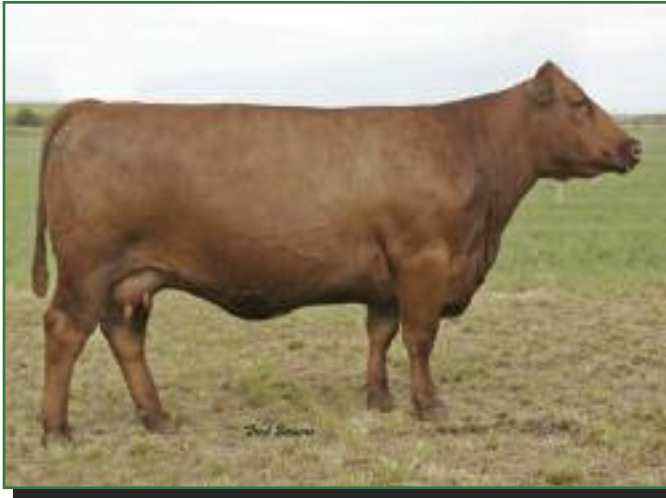
PERKS MISS CHATEAU 215R • LOT 59