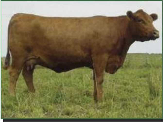
SRN THELMITY 5044 • LOT 41