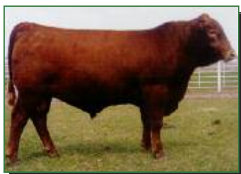
BUF CRK ROMEO L081 BW -1.4; WW 35; YW 71; MILK 26; TM 43; STAY 19; MARB 0.17; REA -0.02