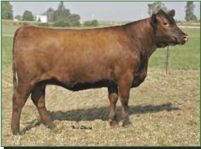
SRN Ms. QUEEN 6028 • DAUGHTER OF LOT 75

Bred 5/6 to BECTON NEBULA N045 (#978419). Pasture exposed from 6/1-8/1 to BASIN NEW TREND 4554 (#1121766). 6002 is an ultra low birth weight first calf heifer with an outstanding udder. The Silver Bullet cows make nice females.