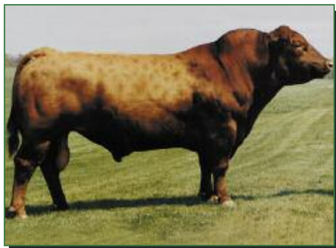
BFCK CHEROKEE CNYN 4912 • SIRE OF LOT 86

Pasture exposed from 5/18-8/1 to BASIN NEW TREND 4554 (#1121766). 1962 is a Cherokee Canyon out of a Straight Arrow dam, they're hard to find.