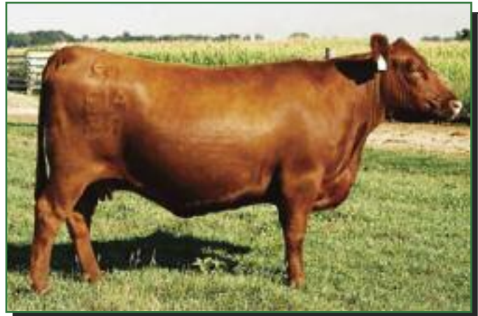
R2 GOLDIE A13R5 • LOT 32