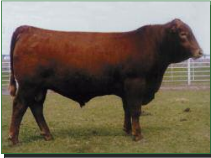
BUF CRK ROMEO L081 • SIRE OF LOTS 10 & 11