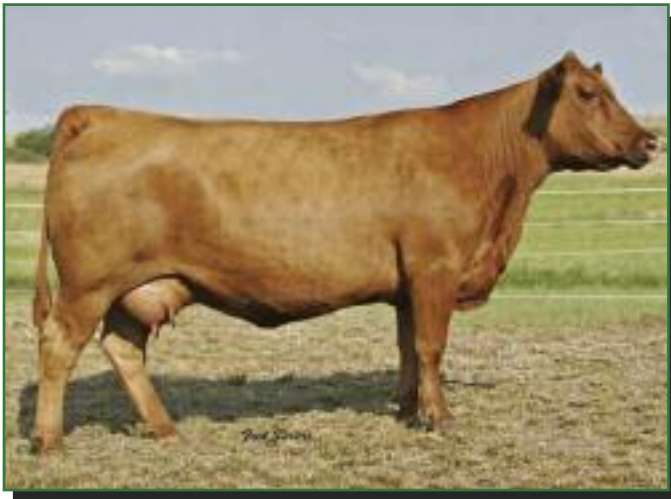
SRN HI DEE 2041 • LOT 43