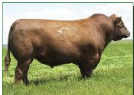
SCHULER SILVER BULLET 4604P BW -3.7; WW 16; YW 49; MILK 15; TM 24; STAY 10; MARB 0.25; REA 0.27