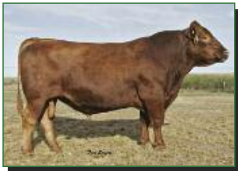
HXC HEMI 4400P BW -3.5; WW 37; YW 69; MILK 20; TM 38; STAY 9; MARB 0.46; REA -0.02