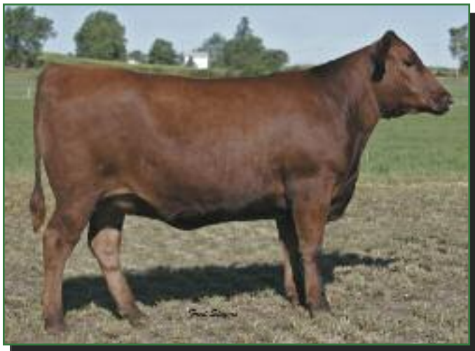
SRN COPPER QUEEN 6011 • DAUGHTER OF LOT 36

Glacier Logan 210 on top of a Copperqueen, enough said!