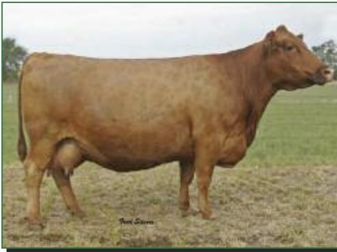
WPRA HR TYRA 002 • LOT 60