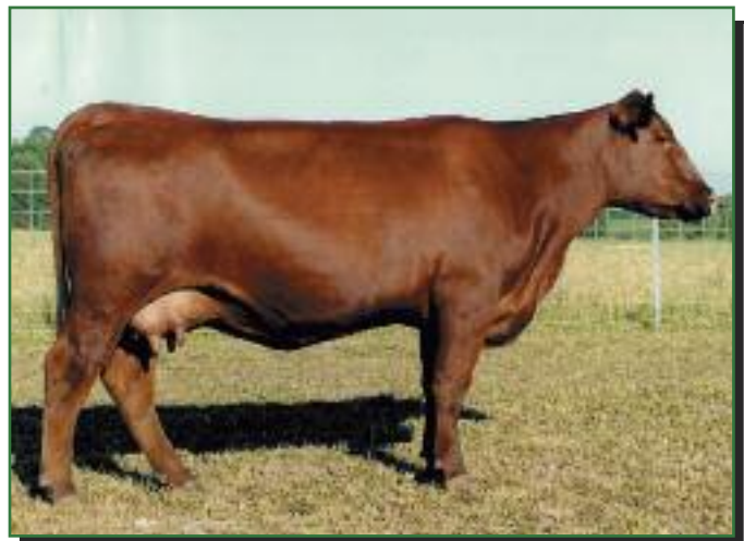
FORSTER COPPERQUEEN 7166 DAM OF LOT 34