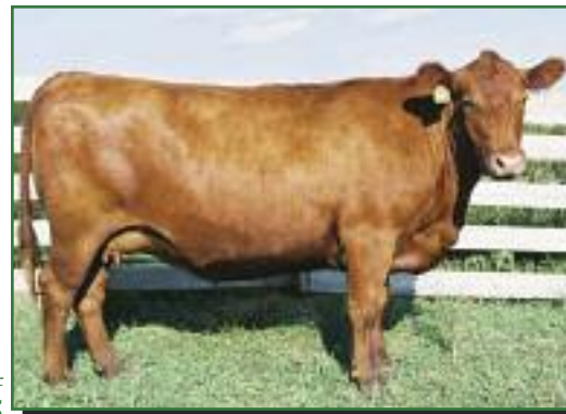
SRN ROBIN 4044 LOT 45

An exciting combination of power from the 94k cow, with the calving ease credentials of Tidy Bee. A bull was the leading Red Angus bull at the feed conversion test of Lee Leachman's in Colorado. The bull has since been syndicated. Remember it cost money to feed these cattle- so you better have the good ones.