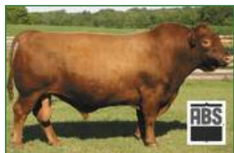
LCC GRAVITY B252L BW -0.7; WW 33; YW 60; MILK 11; TM 28; STAY 14; MARB 0.14; REA 0.29