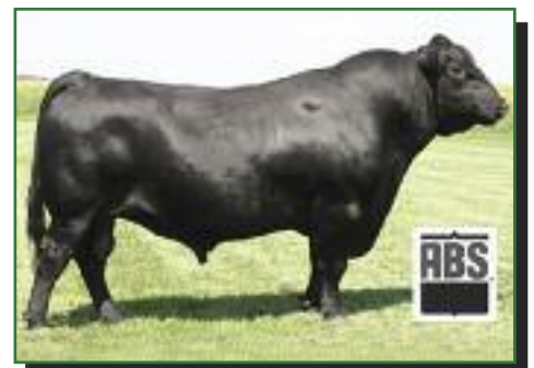
BON VIEW NEW DESIGN 878 SIRE OF LOTS 14 AND 15

This is the most unique mating we have to offer to date.