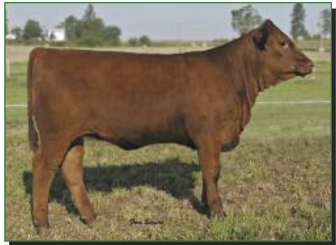
SRN ELEANOR 6050 • DAUGHTER OF LOT 19