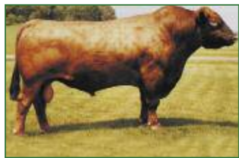
GLACIER LOGAN 210 BW -1.0; WW 25; YW 41; MILK 22; TM 34; STAY 19; MARB 0.60; REA -0.15