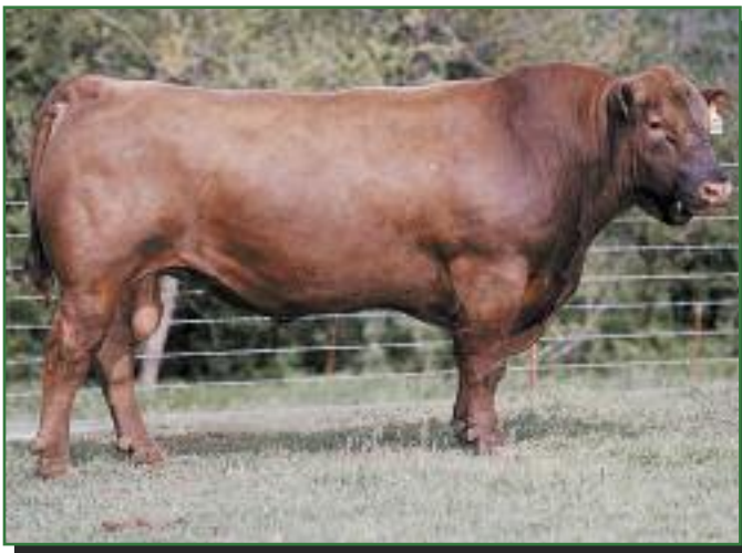
BIEBER MAKE MIMI 7249 • SIRE OF LOT 75A