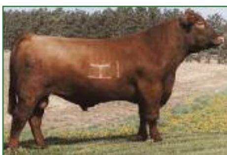
HOLDEN HI HO 7151 BW 3.7; WW 48; YW 81; MILK 8; TM 32; STAY 12; MARB -0.02; REA 0.33