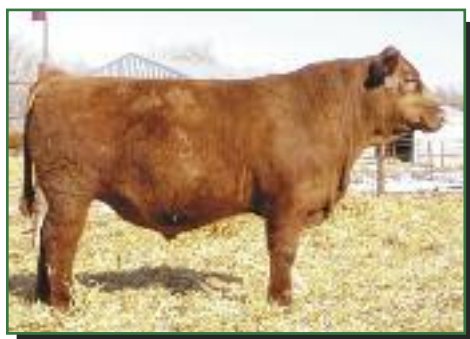
BIEBER ROMEO 10107 BW 1.0; WW 43; YW 81; MILK 25; TM 46; STAY 17; MARB 0.21; REA 0.10