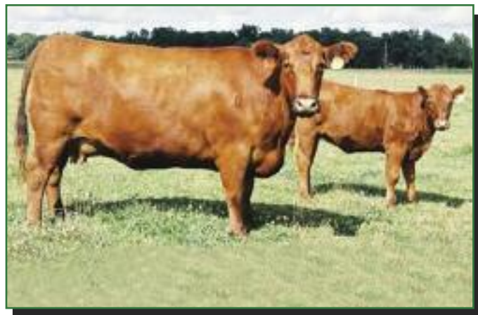
LCC LUCY MA961 AND SRN LUCY 8066 • LOTS 25 & 25A