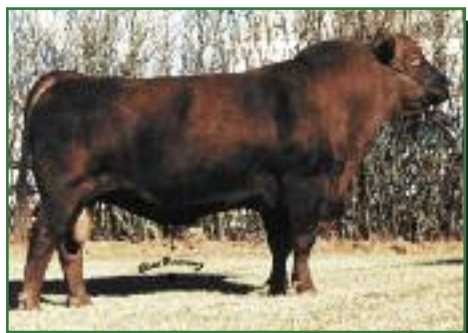
RED BRYLOR NEW TREND BW 3.7; WW 37; YW 73; MILK 32; TM 50; STAY 20; MARB -0.03; REA 0.00