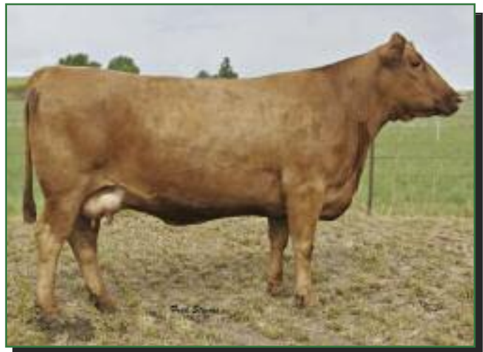
SRN GLISTEN 3014 • LOT 78