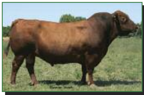
BECKTON NEBULA M045 BW -7.1; WW 29; YW 62; MILK 11; TM 25; STAY 15; MARB 0.16; REA 0.23