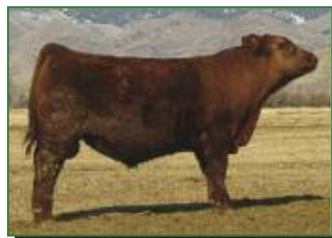
5L FOREVER GRAND 5834 BW 3.4; WW 33; YW 71; MILK 25; TM 41; STAY 12; MARB 0.05; REA 0.13